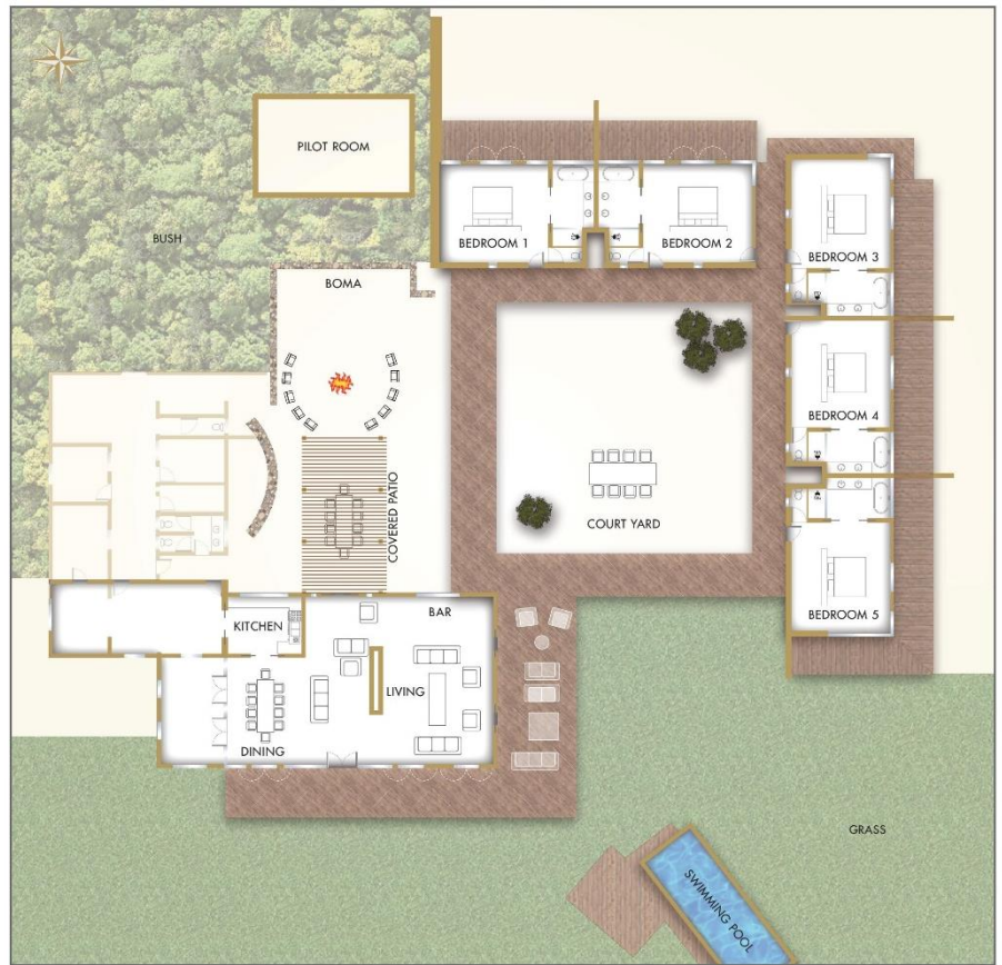
Farm House – 940 m 2 Bedroom sizes (including bathroom) – 52 m 2