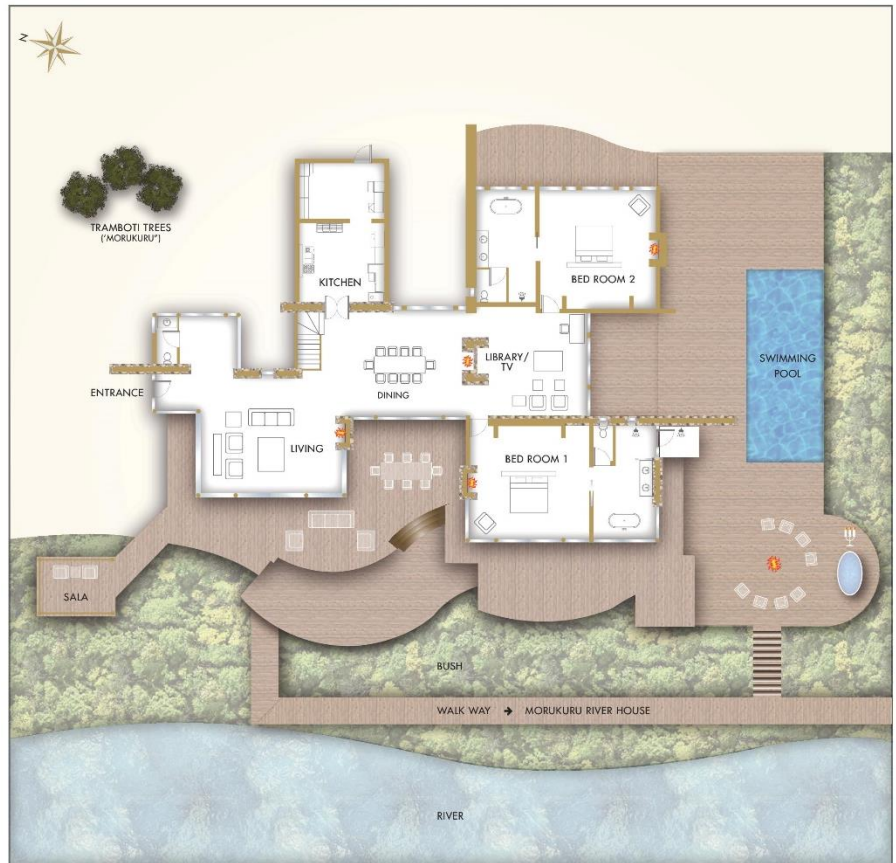
Owner's House – 310 m 2 Bedroom sizes (including bathroom) – 52 m 2