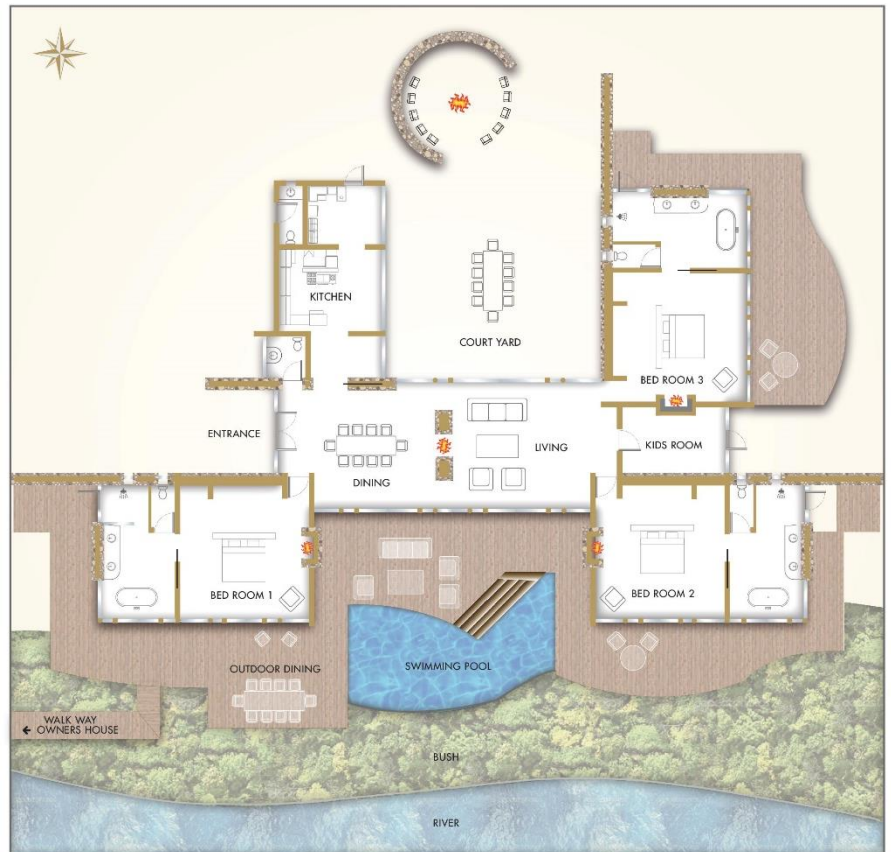
River House – 320 m 2 Bedroom sizes (including bathroom) – 52 m 2